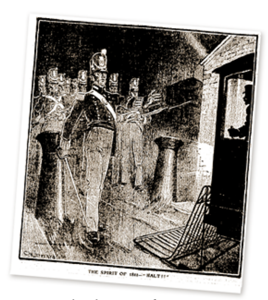
Reproduced courtesy of the C.W. Jefferys Estate