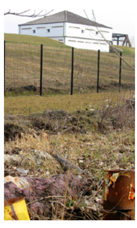
Spring Cleaning: MAYOR MILLER'S COMMUNITY CLEANUP DAY

Join neighbours and friends for an hour or two to pick up litter around Fort York. Celebrate the arrival of Spring by helping to rid Toronto's 41-acre birthplace of tin cans, plastic bottles and shopping bags blown in by the winter winds. Meet your fellow litter-pickers at the west gate, wear suitable clothing, and bring your own gloves. Garbage bags and coffee will be provided.