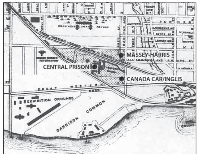
Map of the area, City Engineer's Office, 1885

The history of its development divides conveniently into two parts along a diagonal line formed by the original Grand Trunk Western line from Toronto to Georgetown, later sold to the Toronto, Grey & Bruce Railway, and now replaced partly by East Liberty Street. The triangle northeast of this diagonal, up to King and over to Strachan, was developed first between 1865 to 1900. Very little of its original fabric survives. The other part southwest of the diagonal, down to the CN mainline and over to Dufferin, dates almost entirely from the early 20th century. Most of the buildings constructed there, with the notable exception of the Mercer Reformatory, are still standing.