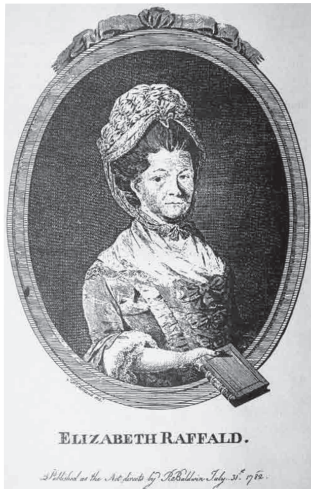
Engraving of E. Raffald in 8th edition (1782) of The Experienced English Housekeeper

The original recipe read as follows: Take lettuce, leeks, spinach, beets and parsley, of each a handful. Give them a boil, then chop them small, and have ready boiled in a cloth one quart of groats with two or three onions in them. Put