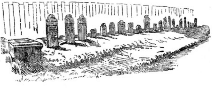
OLD CEMETERY TOMESTONES.

On December 13 a public meeting was held in ArtWord Theatre, Portland Street, to report on planned improvements to Victoria Memorial Square. This park bounded by Niagara, Portland and Wellington streets contains within its limits a military burying ground established in 1794 that is now the city's oldest cemetery. In 2003 it was recognized by the National Historic Sites Board as part of the Fort York National Historic Site.