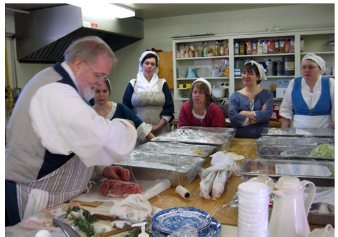
The volunteers watch as a cut of meat is tied in the proper way for roasting.