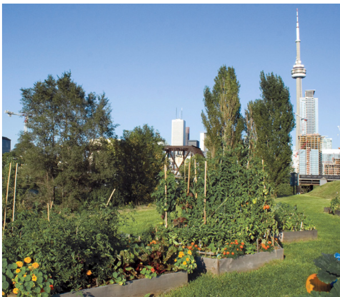
The September harvest in Evergreen's Community Gardens on the fort's north ramparts was bountiful.

Next year we will increase the number of planting beds on the ramparts. As well, we hope the gardeners will be able to recreate the kitchen garden that once stood in the northwest bastion, and maybe a door-garden on the east side of the Officers' Mess. This initiative ties in nicely with the history of the site and our historic cooking program.