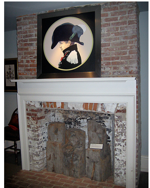
Simcoe's Illusion by Charles Pachter, a gift to the fort, will hang above a mantel in the Blue Barracks. Pegged timbers from the Queen's Wharf are on temporary display below. (Courtesy of Charles Pachter)