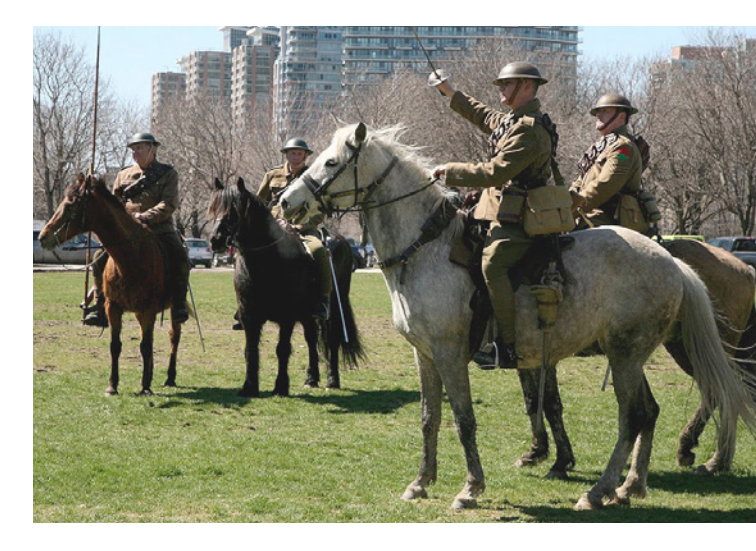
Sword drill was a part of the dramatic demonstrations of cavalry tactics on Garrison Common.