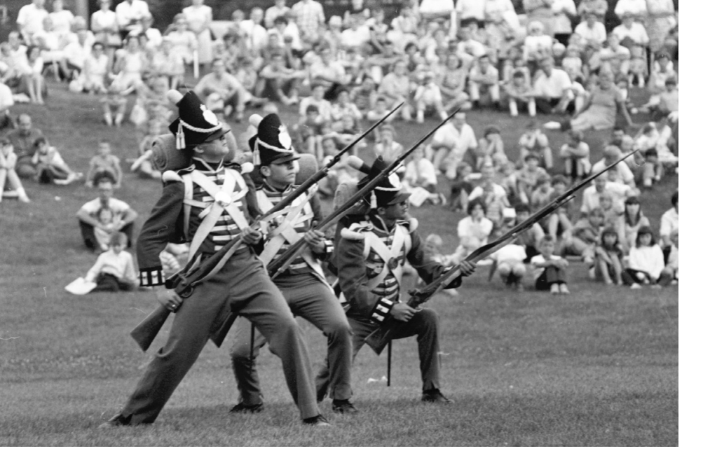
Three guardsmen perform a musket drill for onlookers in Battlefield Park, Stoney Creek, en route from Fort George to Fort York.

The event began with an initial Retreat Ceremony at Fort George where the guard was billeted for the night in the blockhouse. We set off on our five-day march the next day, stopping each evening to perform a Retreat Ceremony in the communities where we were quartered in either a private home or motel.