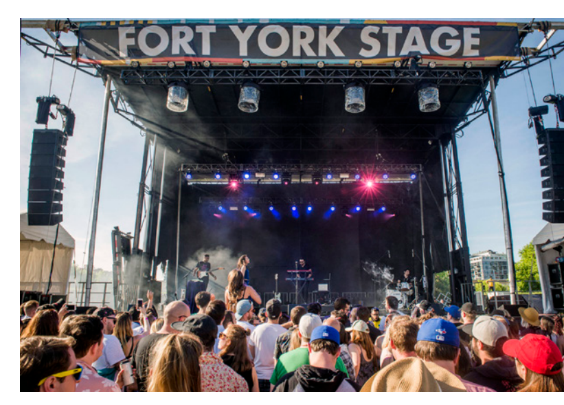
Field Trip, June 3 - 4, 2017

On the construction front, we're still very much surrounded. Work on The Bentway continues across the frontage of Fort York (http://www.thebentway.ca/about/) while construction of Garrison Crossing, the bicycle/pedestrian bridge, goes forward on the Common. We expect most of this work will be complete by year-end so we'll be much easier to find in 2018.